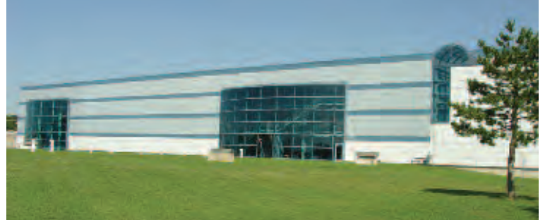
Aurora Water Treatment Facility

The City of Aurora maintains emergency back-up wells. These wells are sampled and tested monthly. This data is not included in this report, but is available upon request by contacting the Water Production Division at (630) 256-3250.