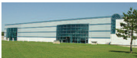
Water Treatment Plant