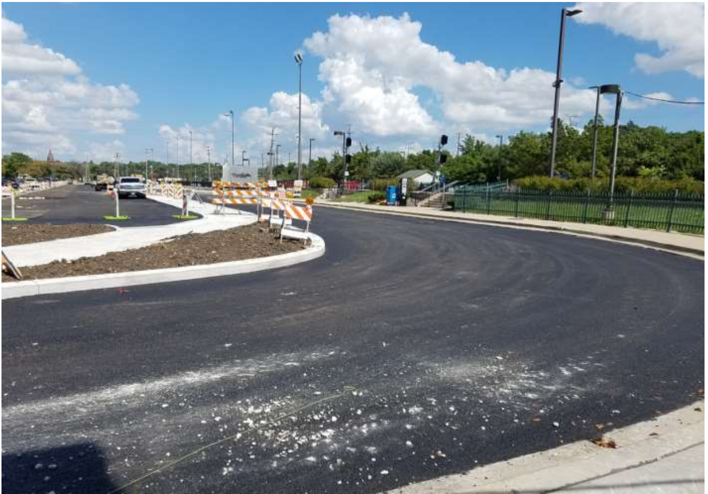
Stage 2- ATC Parking-Pace Staging Area- Installation of binder surface. Looking north