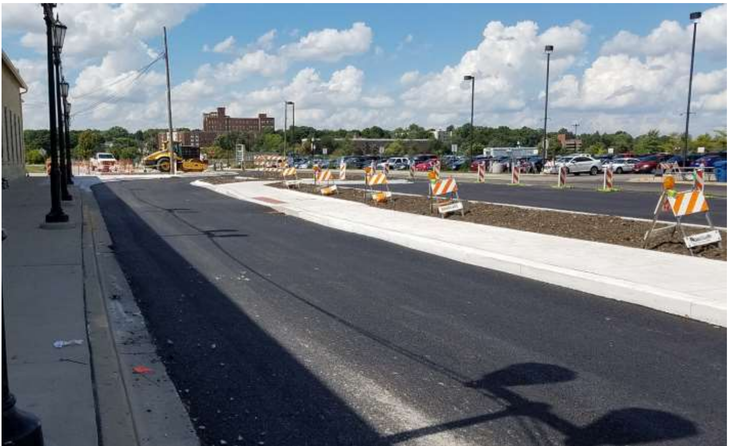
Stage 2. ATC Parking Lot- Installation of Binder Surface, looking west.