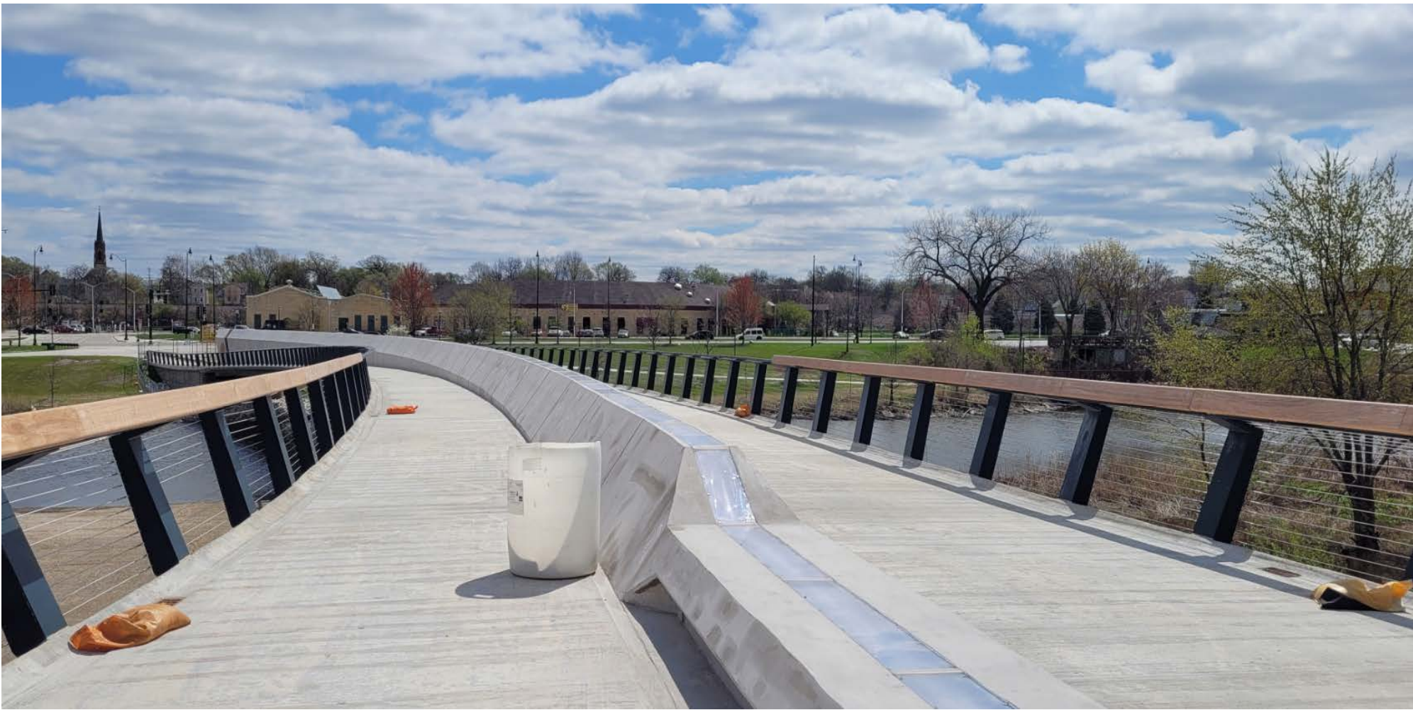
04/14/2021- Looking east, bridge view.