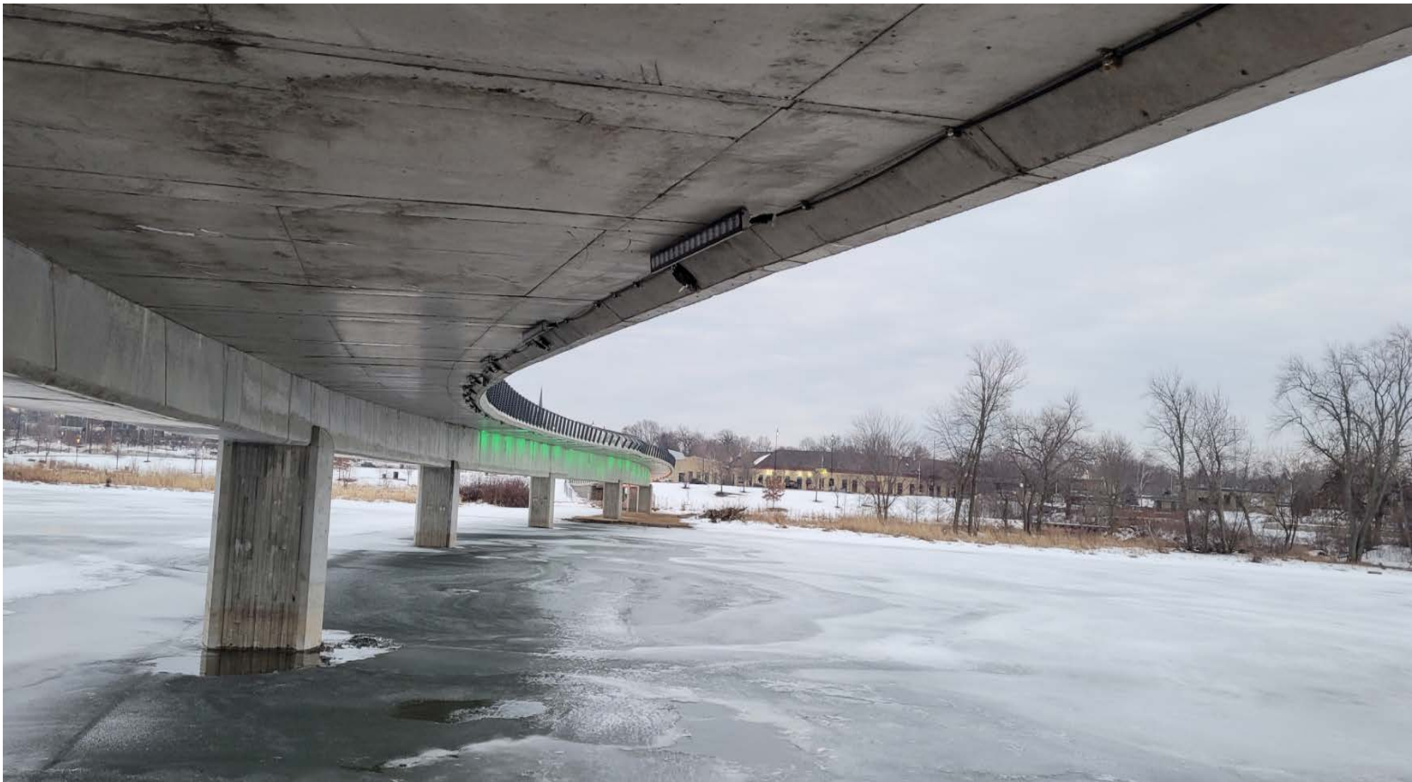
02/26/2021-Bridge view, looking under the bridge, west side of bridge.