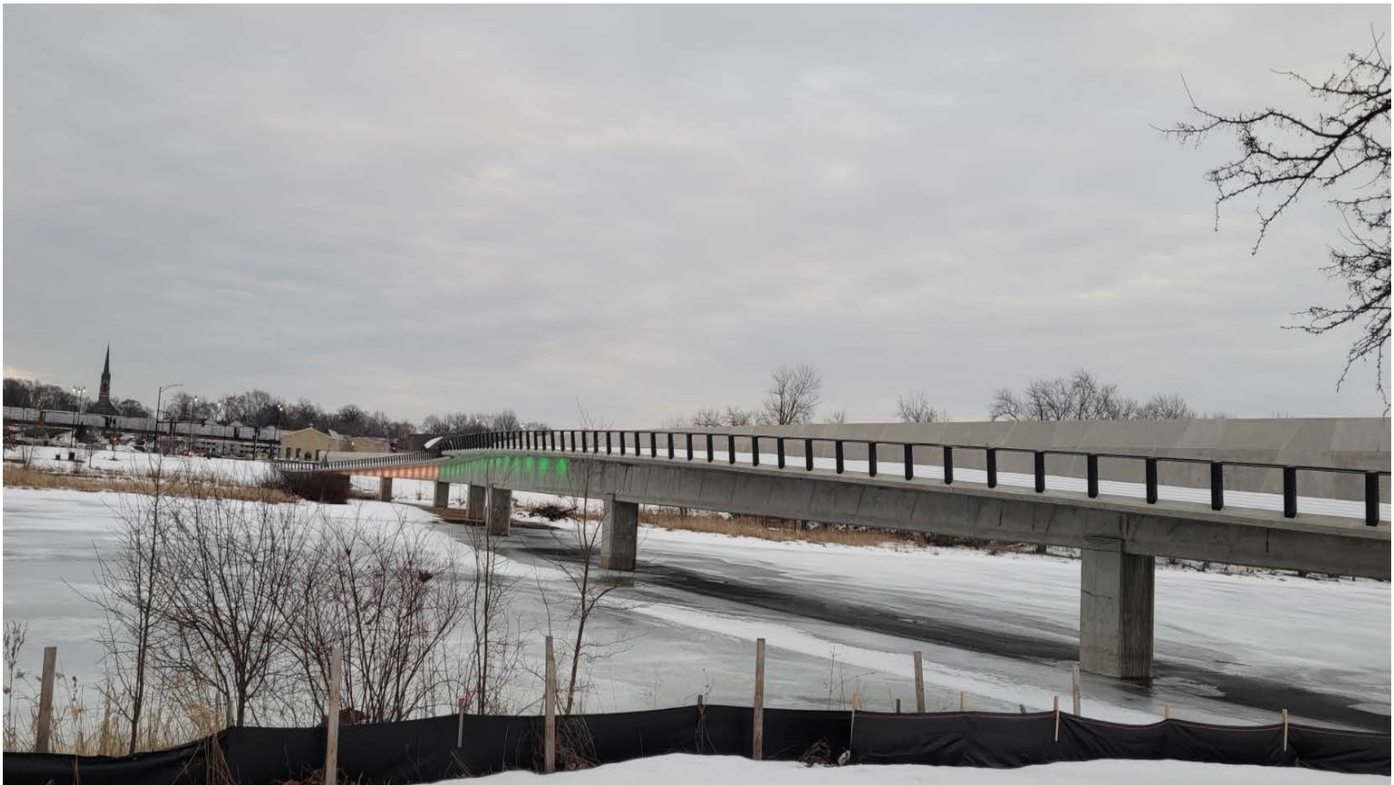
02/26/2021 – Bridge view- Looking SE, west side of bridge