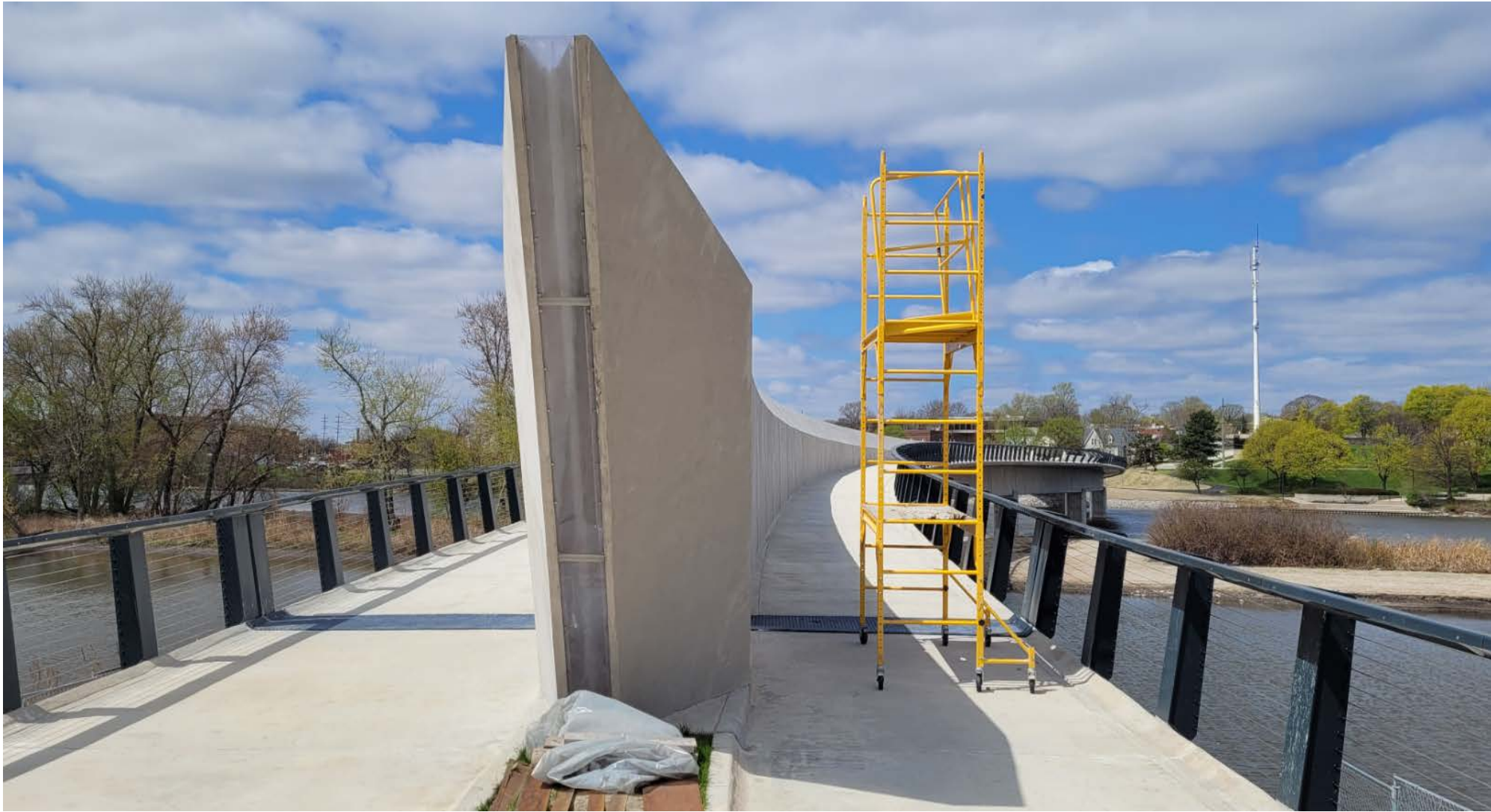
04/14/2021- Looking west, bridge view.