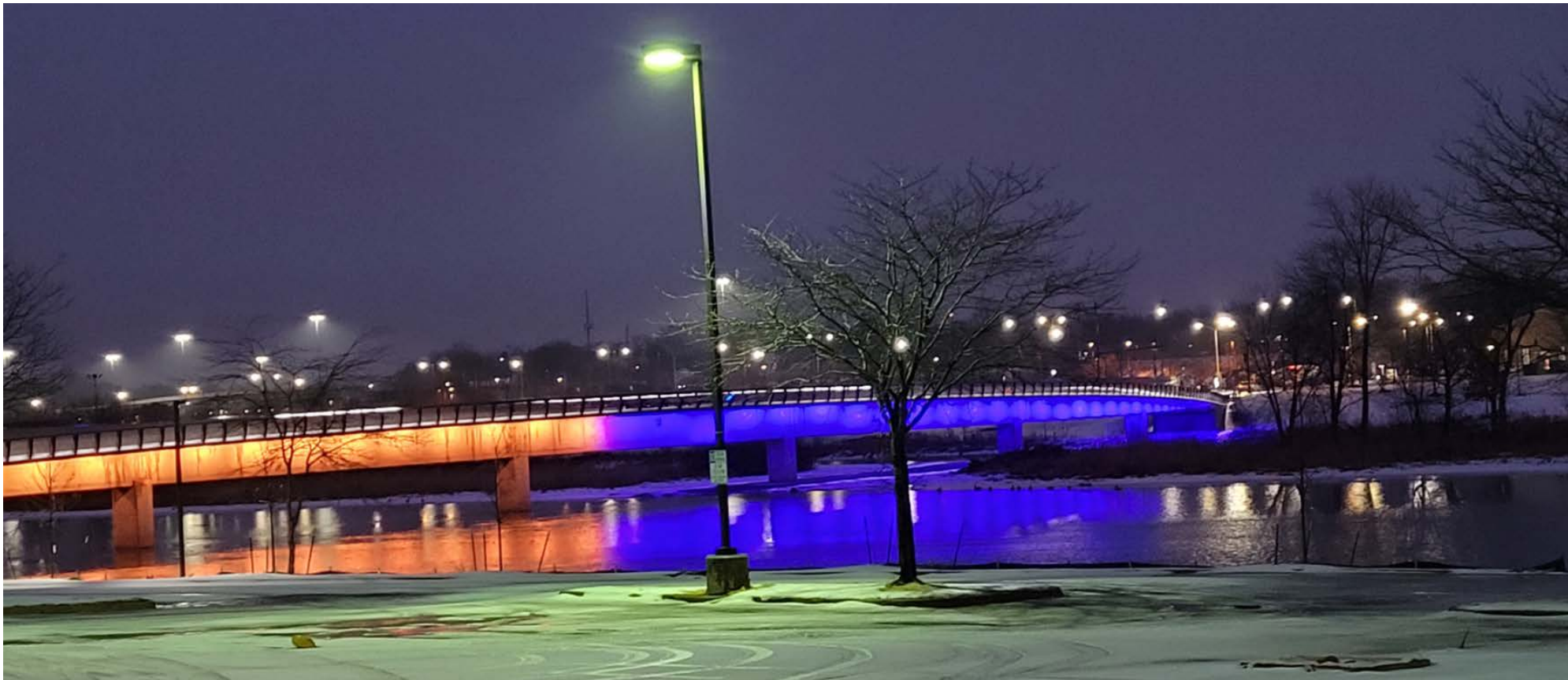
01/14/2021-Bridge View at night. Looking NE, west side of bridge