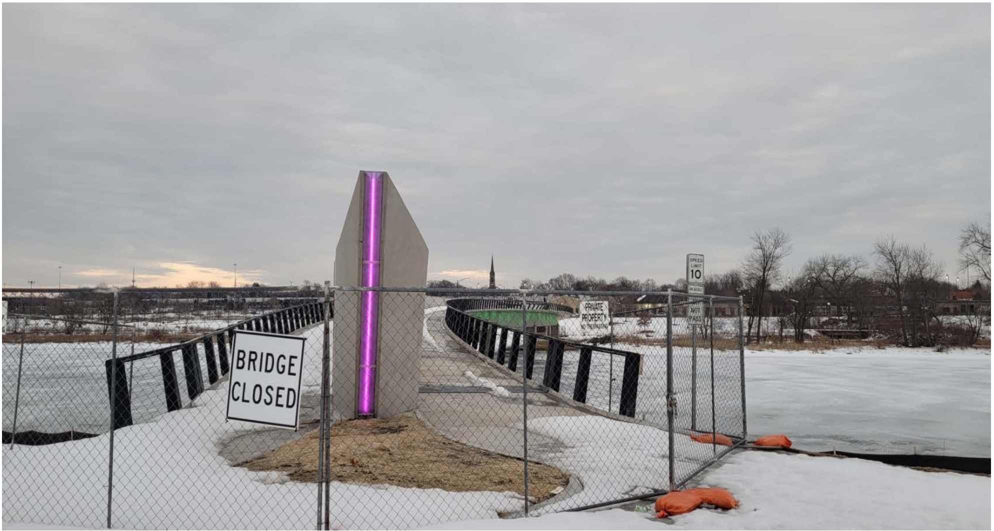
02/26/2021-Bridge view-looking east, west side of bridge.